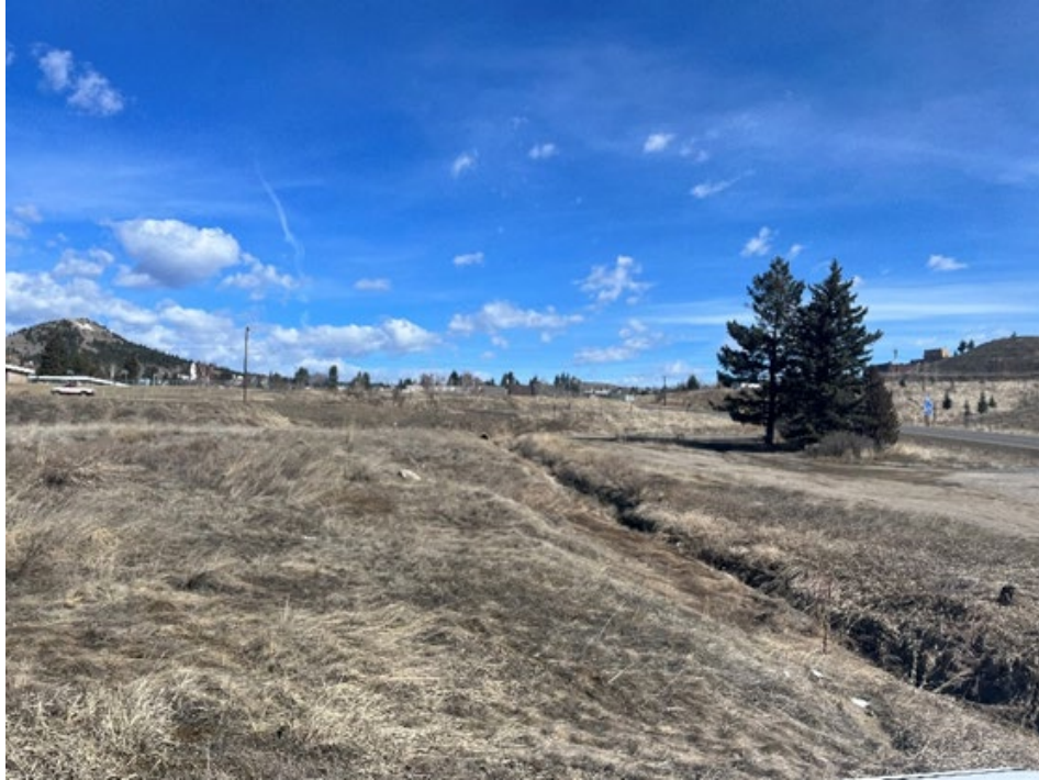
Photograph 3. Overview of additional proposed area.