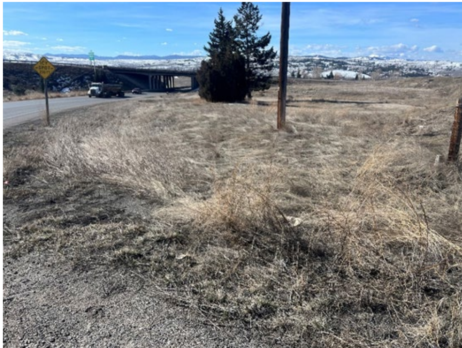
Photograph 4. Overview of the east side of the site.

The area will be further investigated during site sampling for potential opportunistic sample location(s). Adjusted boundary lines, proposed sample locations and other previous findings are included on Figure 1.