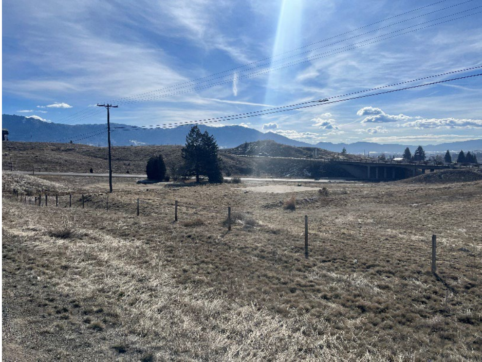
Photograph 1. Overview of BRES No. 120 Bonanza Shaft.