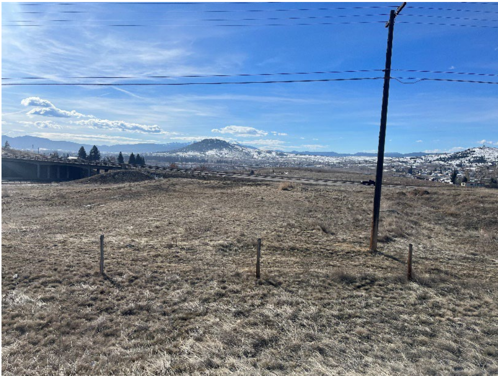
Photograph 2. Overview of BRES No. 120 facing south.