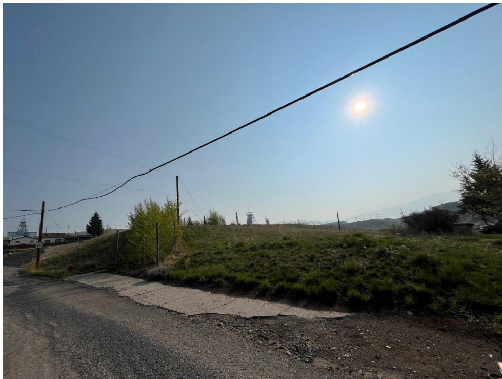
Photograph 2: Overview of the west and south portions of the site facing northeast.

Plant litter is migrating from the site on the west side along North Wyoming Street. No sediment migration was observed from the site. The sidewalk along North Wyoming Street is found to be in deteriorating condition. Overall, the site is in good condition with good vegetation growth.