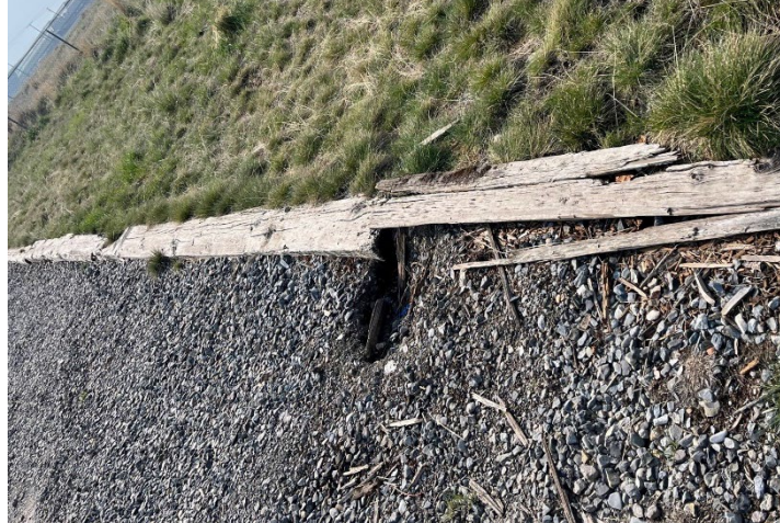
Photograph 3: Hole found near the site.

A small hole was found during the site evaluation. This hole is located in the parking lot of Mandan Park; however, it is on the boundary line with the UR portion of site. Wooden borders, as seen on Photograph 3, surround the north portion of the site that border Mandan Park. Figure 1 illustrates the proposed sample stations as sited during the preliminary site evaluation. Adjusted boundary lines, previous sample locations, and other previous findings are included on Figure 1.