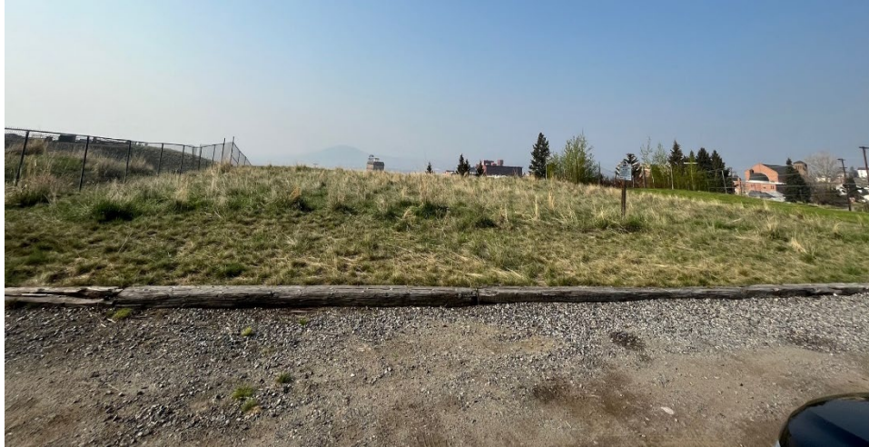
Photograph 1: Overview facing south from the Mandan Park Parking Lot.