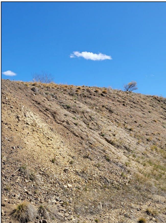
Photograph 3: Erosion and Staining Along South Slope.