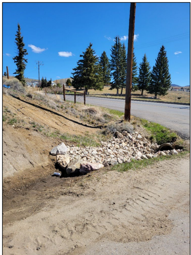
Photograph 4: Sediment Control on Southeast Corner of Site Capturing Sediment Migration.