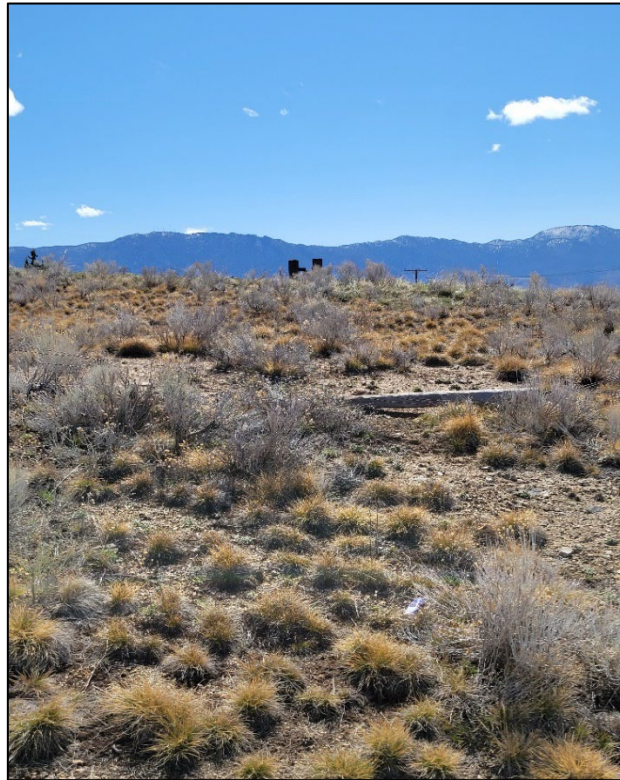
Photograph 1: Barren Areas Throughout the Site. Sage and Grasses Are Pedestalling Due to Erosion.

A preliminary site visit was conducted to better qualify existing site conditions and identify areas of focus for additional evaluation. Site photographs from the Site visit conducted in the spring of 2022 are included in this section for reference. The south slope has intense erosion and sediment movement onto the roadway transporting south to a rock catch and drain. Sage and grasses are present with barren areas scattered throughout the vegetation. The east slope has trees along the roadway and has poor grass cover with what looks to be decomposed granite, sands, and weeds throughout the area. Temporary Best Management Practices have been installed along the west boundary to manage sediment translocation along the roadway.