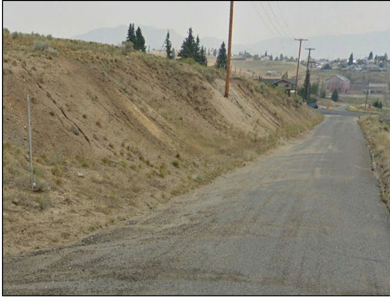
Photograph 2: Steep Slopes with Heavy Erosion onto Road.