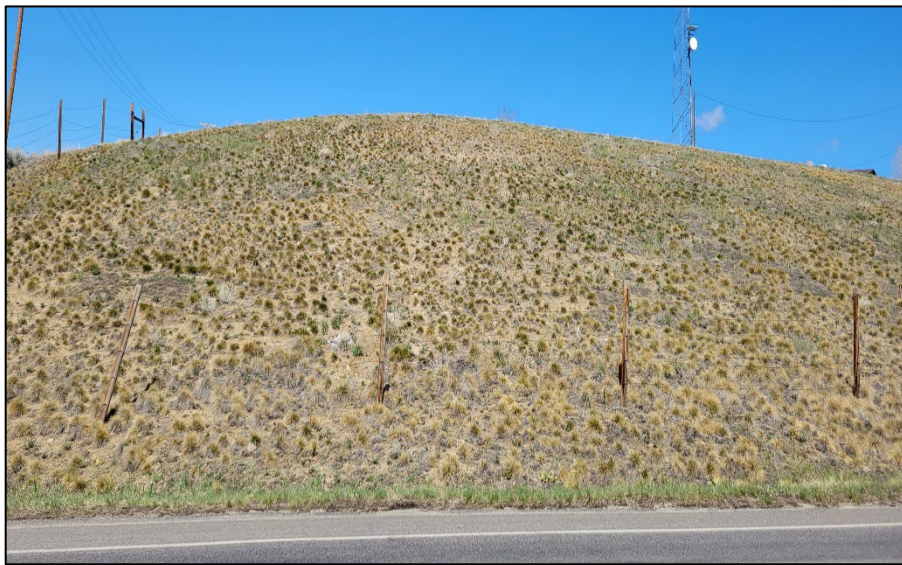
Photograph 6: East Facing Slope has Grass Establishment, Very Patchy.