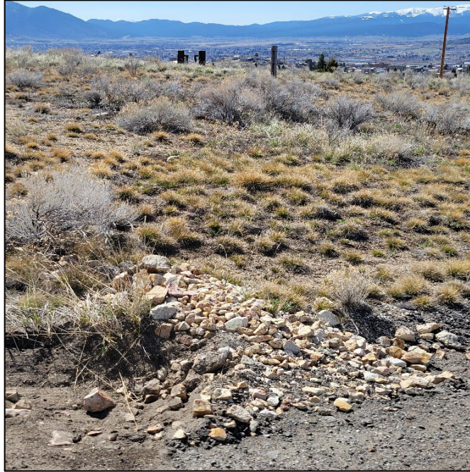
Photograph 5: Temporary Best Management Practices along West Boundary. Evidence of Sediment Migration.