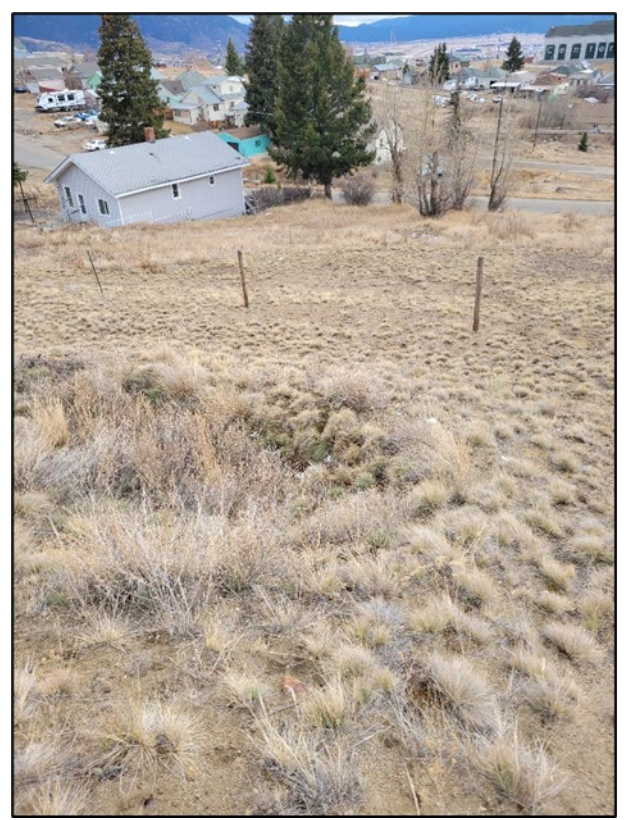
Photograph 7: Possible Historical Mine Exploration Pit.