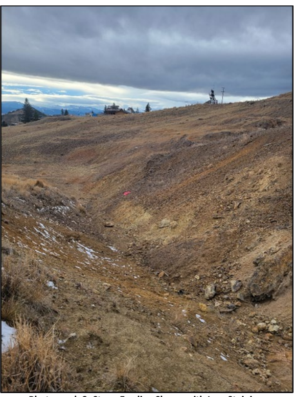
Photograph 3: Steep Eroding Slopes with Iron Staining.