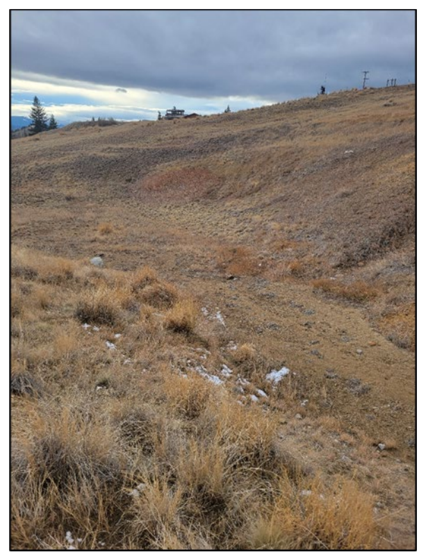
Photograph 3: Area of Soil Deposition from Storm Water Inlet.