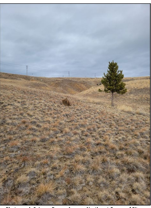
Photograph 6: Large Barren Area on Northeast Corner of Site.