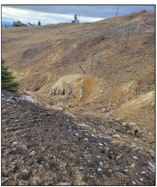
Photograph 4: Edge of BSB Remedial Action and Large Gully.