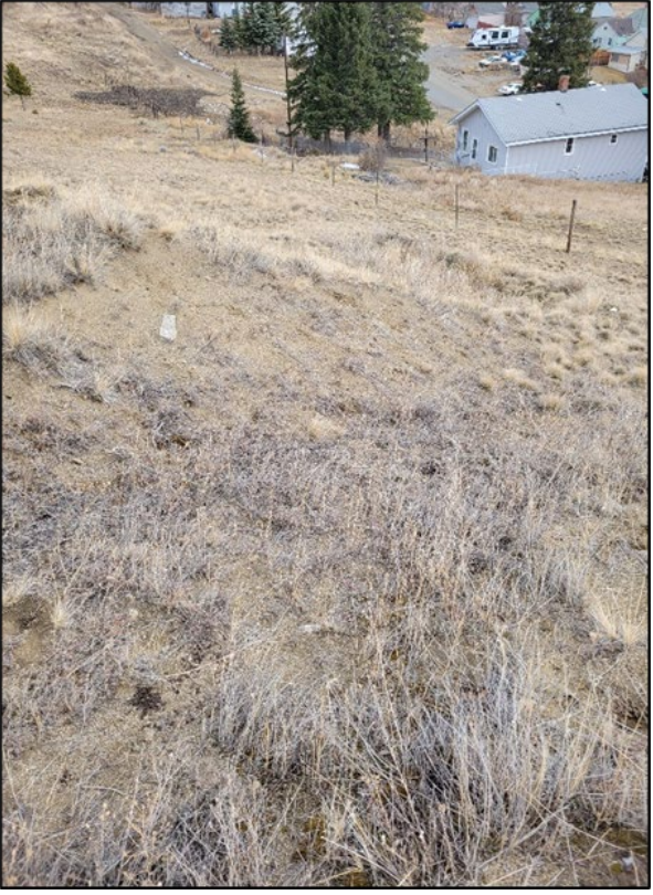
Photograph 8: Barren Area Around Possible Excavation Pit.