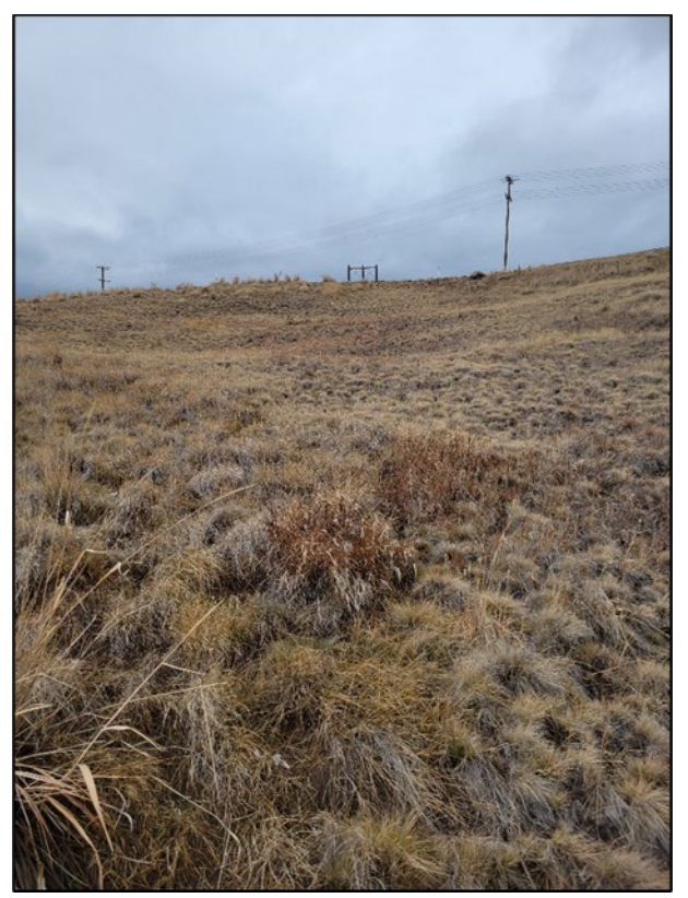
Photograph 5: Site has Good Vegetation on the Western Portion.