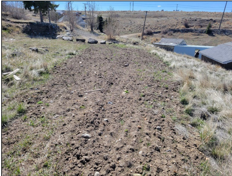
Photograph 1: Area of Previous Remediation in 2021.

A preliminary site visit was conducted to better qualify existing site conditions and identify areas of focus for additional evaluation. Site photographs from the spring of 2022 are included in this section for reference. The south access was blocked and BSB laid 20 cubic yards of EPA-approved cover soil; no notes from the work were completed about seeding. Within the rock outcropping area of the Site, there are many different piles of material with unknown sources. There is active erosion along the north boundary of the Site with run-on and runoff occurring, and this has caused extreme washout on the side of the roadway (Photograph 6). To redirect storm water flows, BSB has installed temporary berms (Photograph 5).