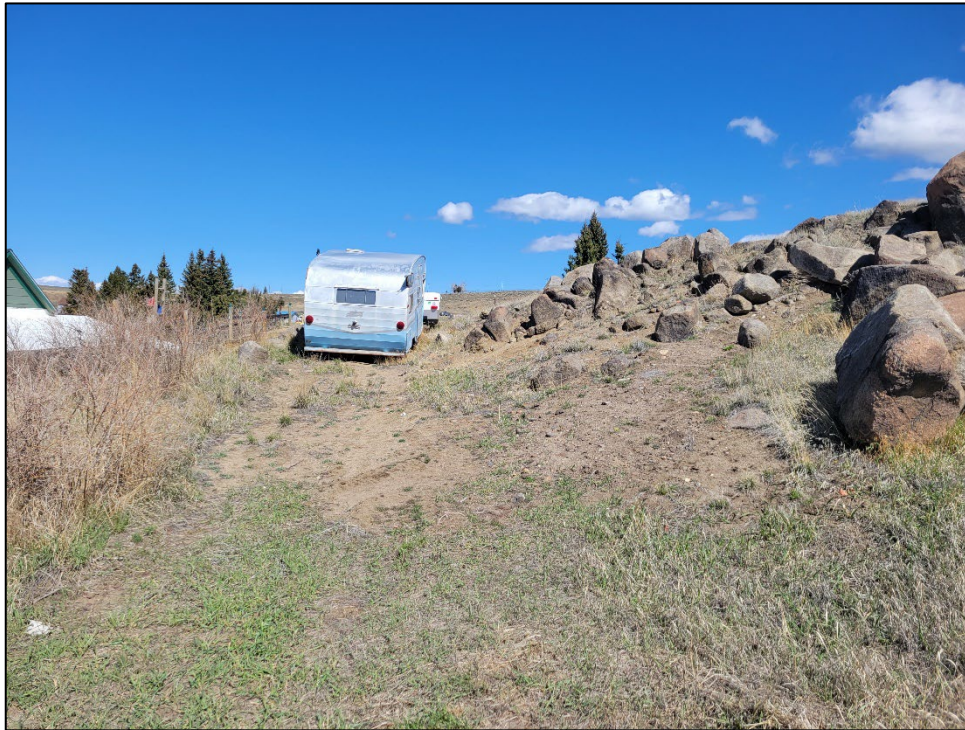
Photograph 3: Rock Out Cropping or Rock Dump.