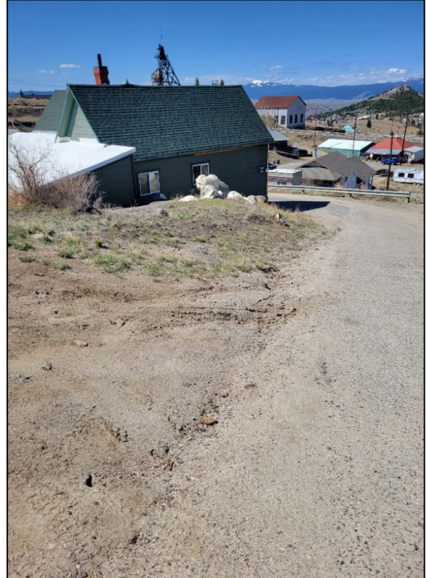
Photograph 6: Storm Water is Eroding into and Under the Roadway.