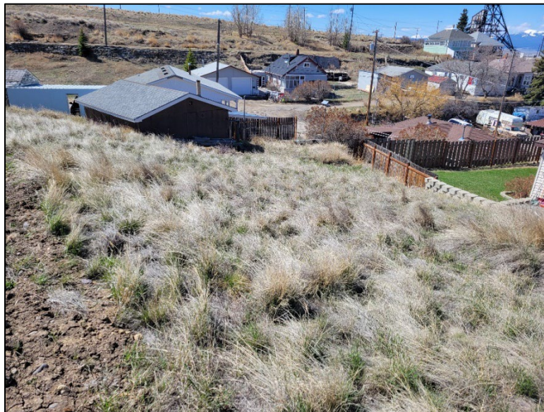
Photograph 2: Good Grass Cover West of New Reclamation Work.