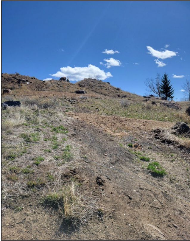
Photograph 5: Temporary Dirt Berms Installed by BSB to Mitigate Sediment Transportation Through the Site and onto the Roadway.