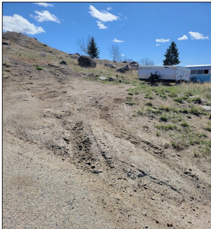
Photograph 4: Sediment Runoff from Site to Road.