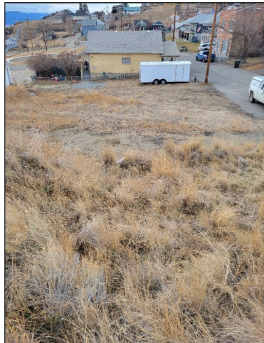
Photograph 2: Parking Area with Vehicle Traffic