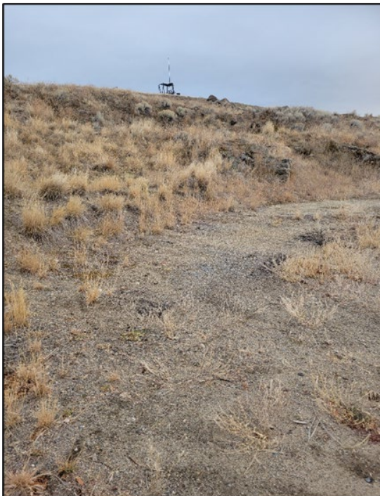
Photograph 1: Steep Slopes and Parking Area

A preliminary site visit was conducted to qualify current site conditions and identify the focus areas for additional evaluation. Site photographs were taken during the preliminary site evaluation to capture site conditions. The photographs are included in this section for reference. The site consists of a barren parking area with gravel and fine material. Steep slopes appear to have bedrock outcropping throughout the slope. The site appears to exhibit weeds and undesirable species among native grasses throughout the barren areas and along the benches of the slopes. Small barren areas are located throughout the hillside, consistent with a rock outcropping.