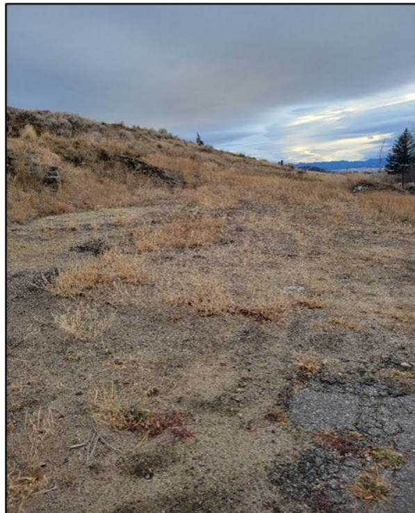
Photograph 4: Fine Material and Sediment throughout Barren Area