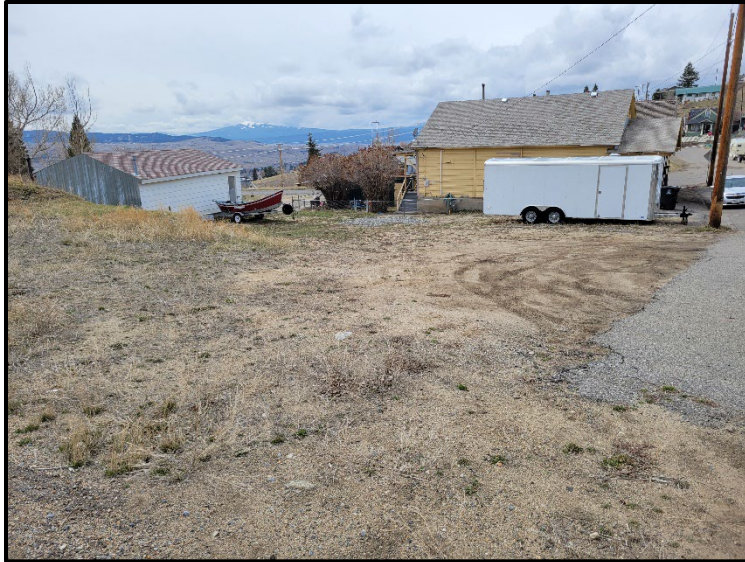
Photograph 3: Barren Area near Residential lot