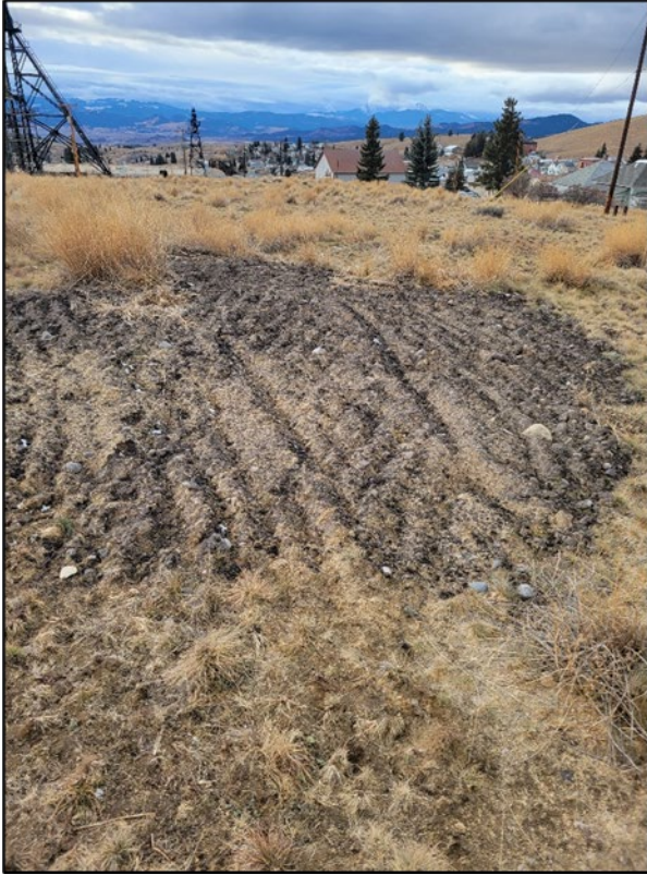
Photograph 3: Repaired Barren Area/Vegetative Improvement