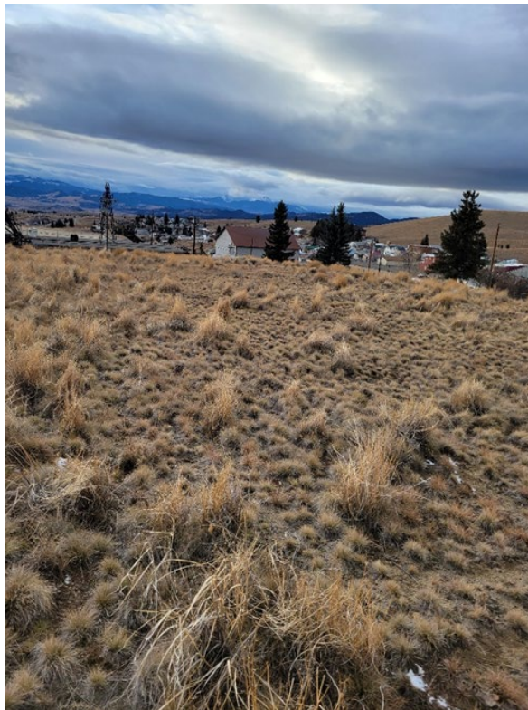
Photograph 5: Well Vegetated Area with Grasses