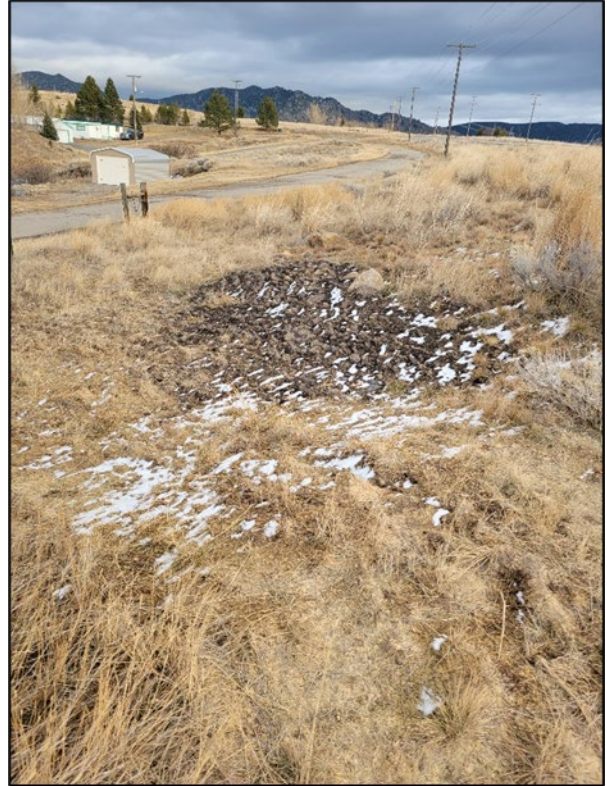
Photograph 2: Repaired Barren Area/Vegetative Improvement