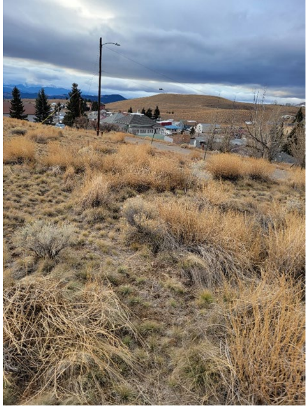
Photograph 4: Diverse Establishment of Grasses and Vegetation