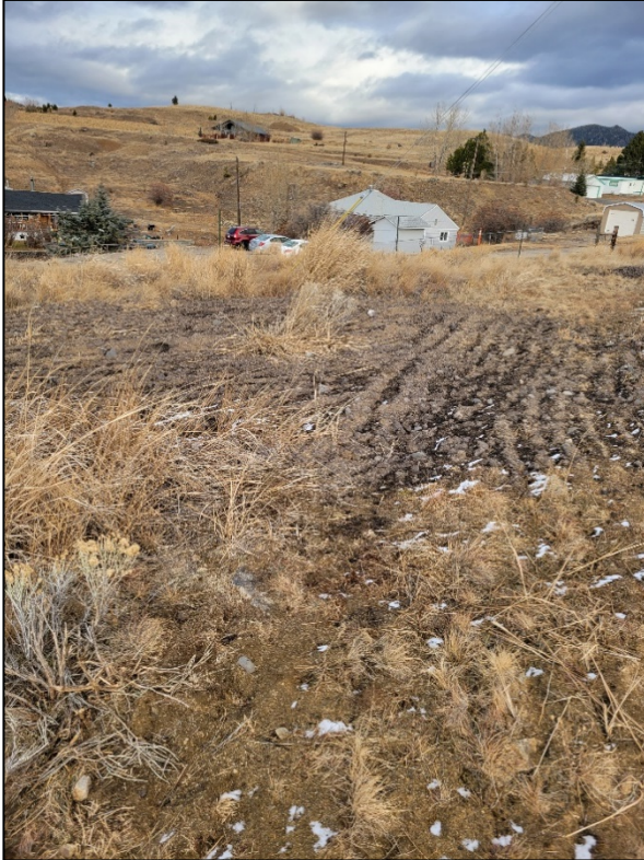
Photograph 1: Repaired Barren Area/Vegetative Improvement

A preliminary site visit was conducted to qualify the current site conditions and identify areas of focus for additional evaluation. Site photographs were taken during the preliminary site evaluation to capture site conditions. The photographs are included in this section for reference. The site appears to be well vegetated with minor areas of bare ground around grasses. Although weed identification is difficult in winter months, it appears the site has limited weed establishment. Remediation efforts have been conducted by BSB in 2021 addressing previous barren areas.