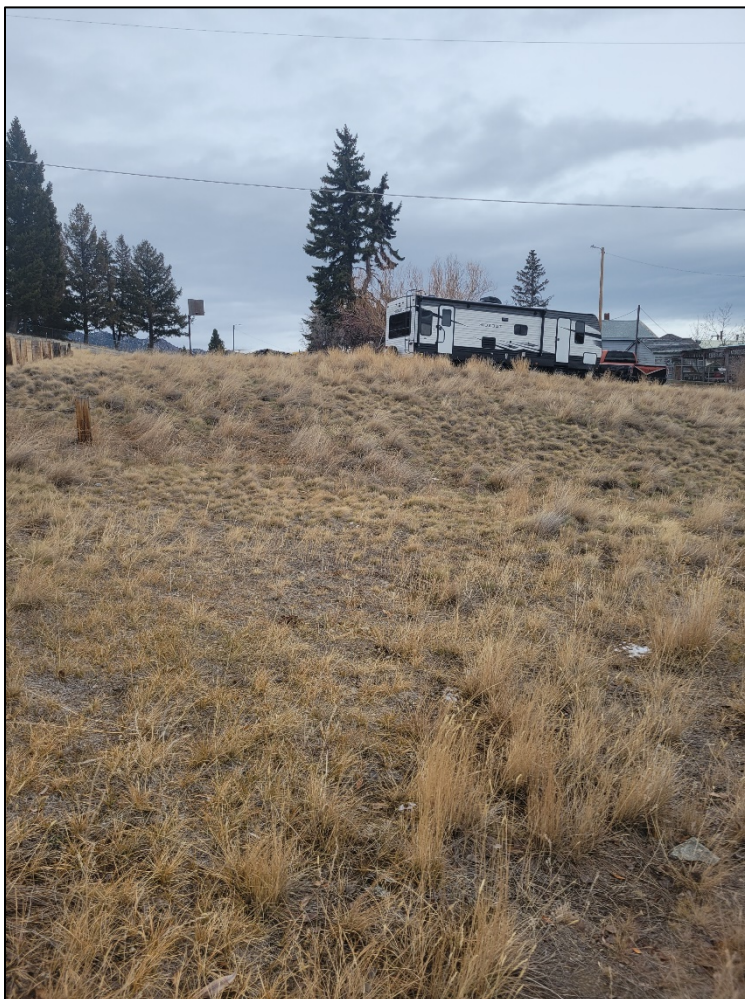
Photograph 3: East Portion of Site Contains Minor Barren Areas