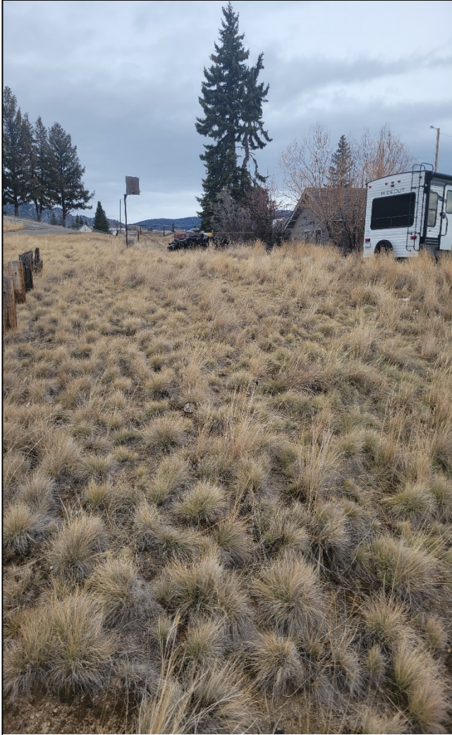
Photograph 1: North Portion of Site is Well Vegetated