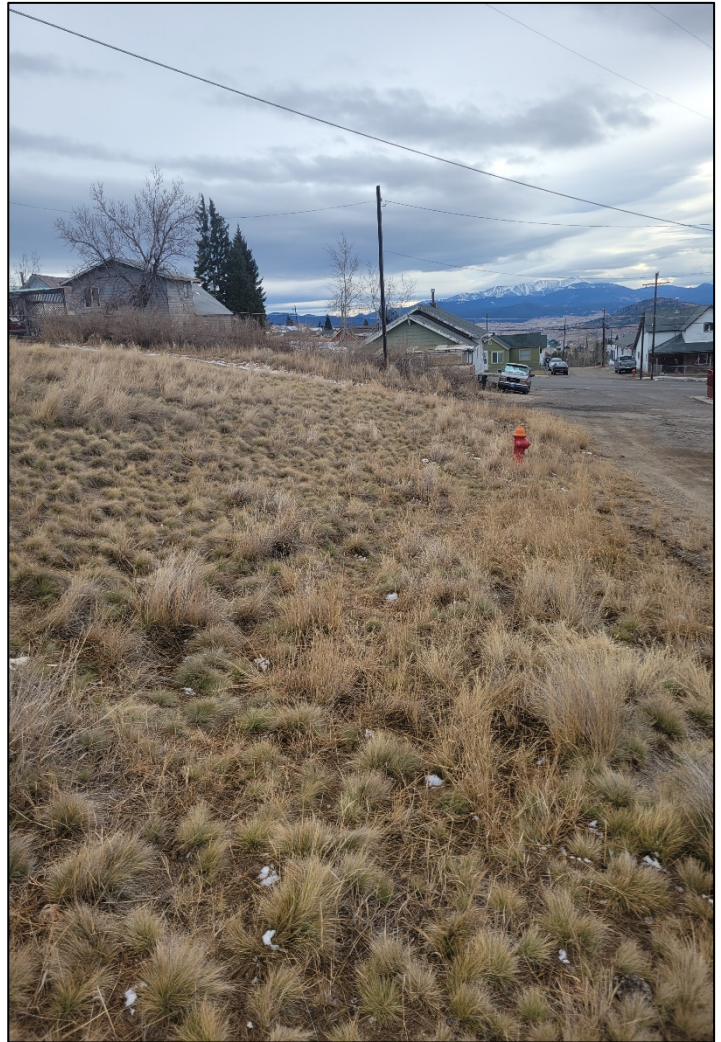
Photograph 2: Southwest Portion of Site is Well Vegetated