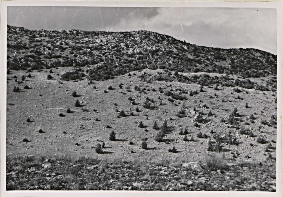
Dry Creek sandstone, Mayflower Mine area