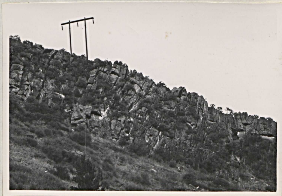
Blocky Pilgrim, South Boulder