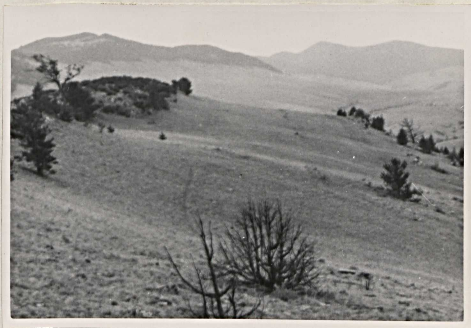
Meagher, Wolsey, Flathead, Mayflower Mine area