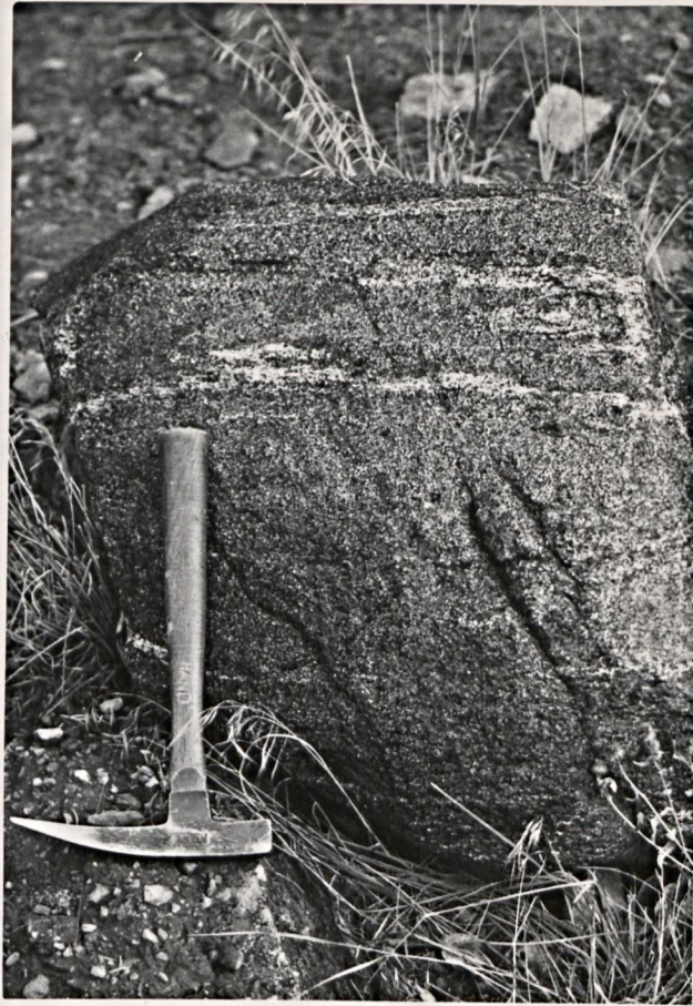
Pony gneiss, South Boulder