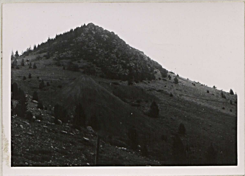
Mayflower Fault and East Mayflower Mine dump