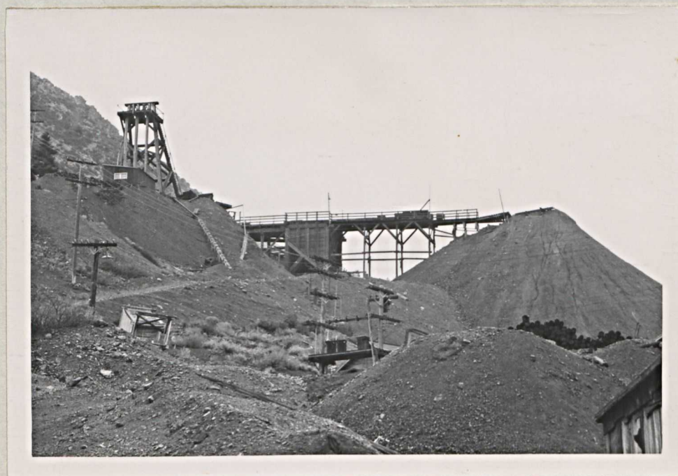
Mayflower Mine, near Whitehall, Montana.