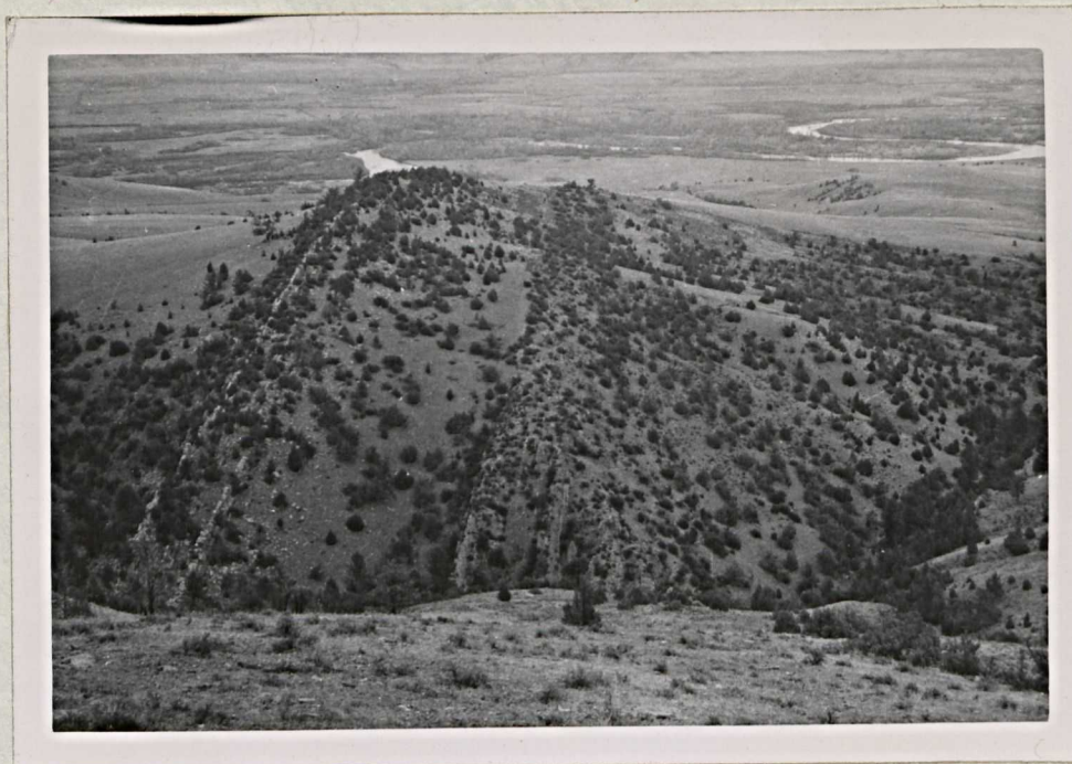
View looking north, Mayflower Mines area, showing the Flathead, Wolsey, and Meagher of the Cambrian.