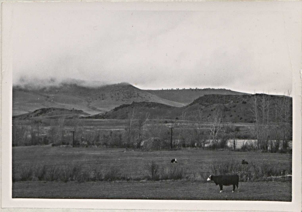
Livingston, South Boulder