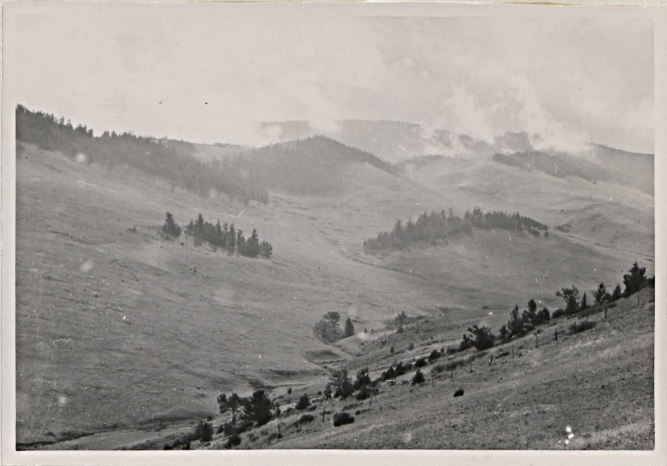
Kootenai, Mayflower Mine area