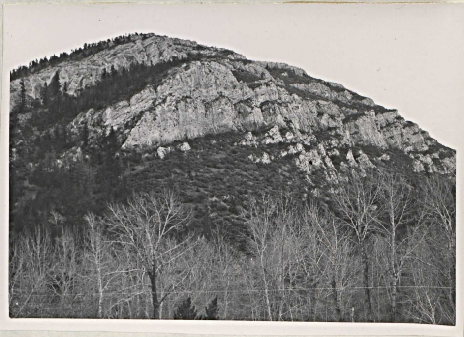
Madison, South Boulder