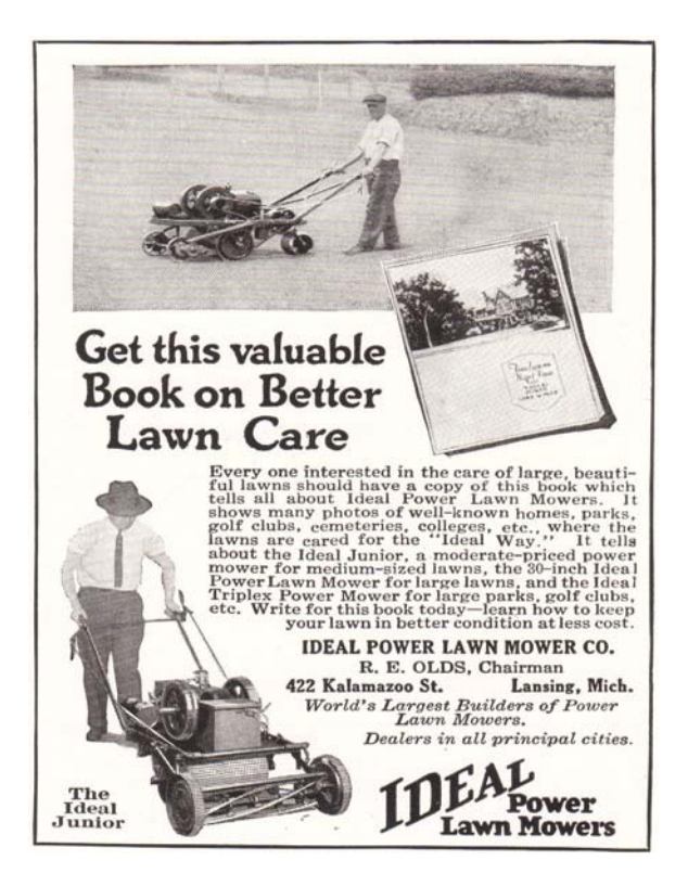
Figure 2: Advertisement illustrating the advance of labor saving machinery

accompanied a parallel shift in the predictable occupational ailments. Over time, the common workplace injuries began a permanent retreat from the soft tissue injuries endemic to manual labor, to one defined by the physical and chemical stressors related to mechanized tool use, primarily through noise, vibration, and inhalable engine emissions.