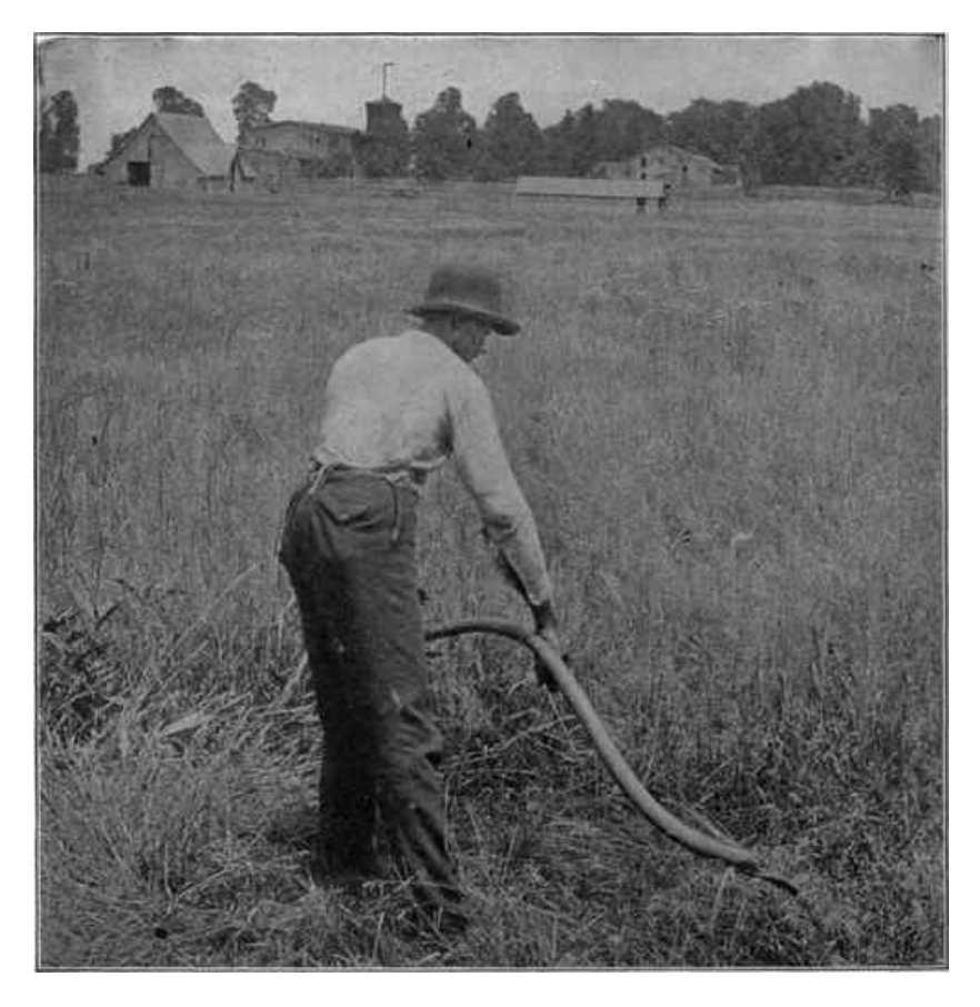
Figure 1: Cutting with Scythe (Belgart, 2014)

As society's collective wealth grew, a growing need for maintaining parks, grounds, and planned landscapes developed. The concurrent advance of mechanized labor with the applied utility of the small combustion engine helped to nurture cultural interest in maintaining the lawn & grounds surrounding both public and private buildings.