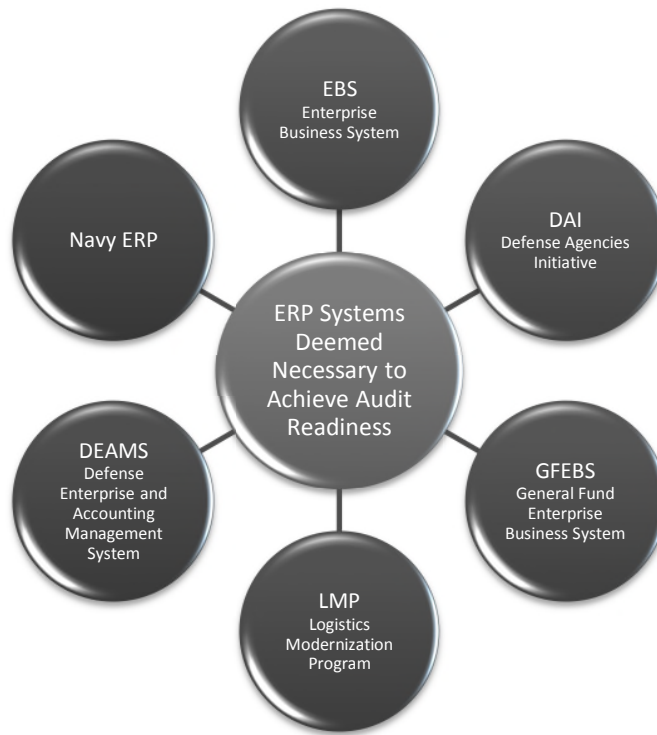
Figure 3. DoD ERP Systems